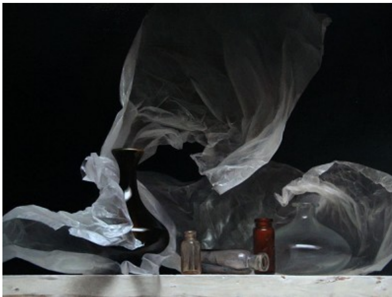
Above: "Bottle Collection" by Sadie Valeri

11 Broad Street Charleston SC 29401 (Just North of Bay Street)