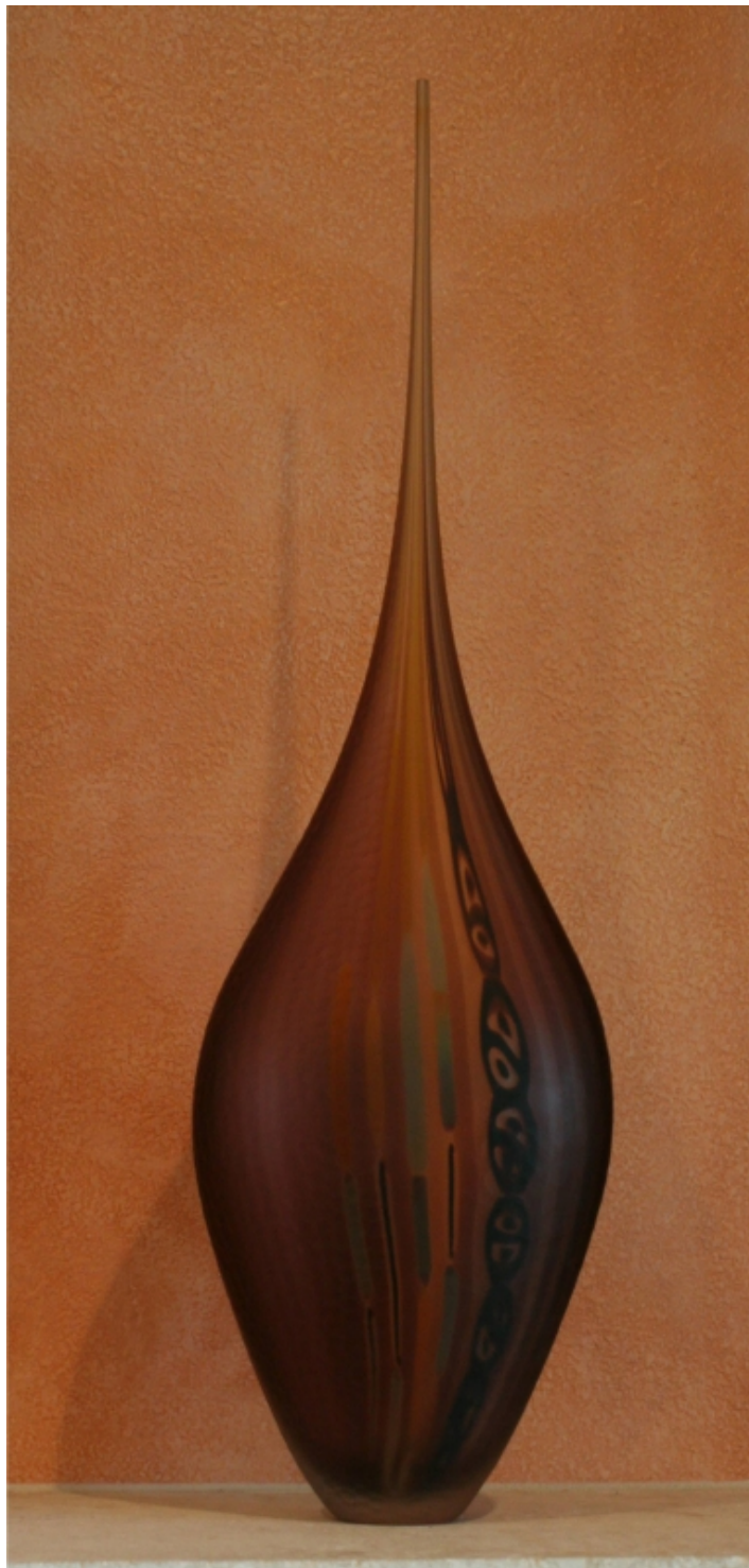
'Mandolino' Murano Vase with Serveo and Filigree pattern by Afro Celotto