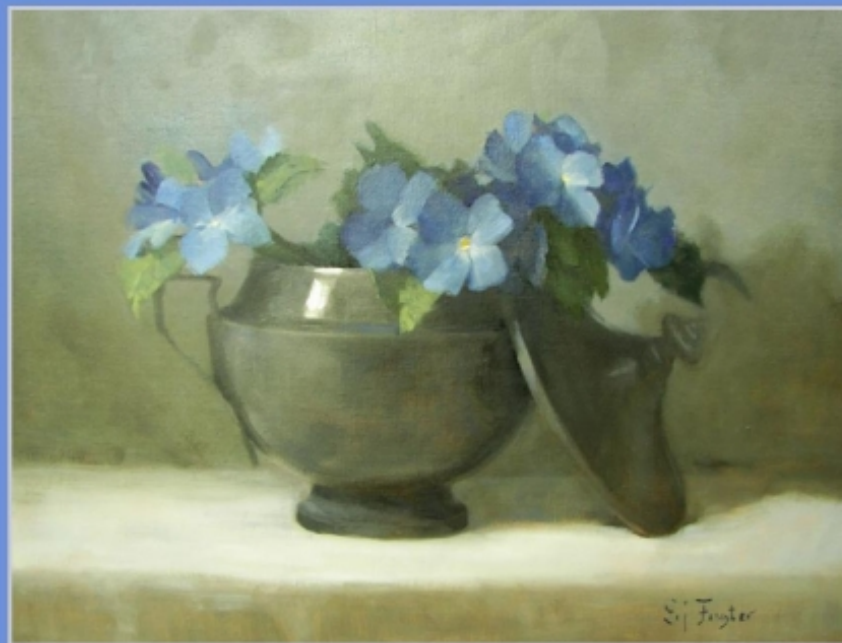
“Blue Hydrangeas in Pewter” 16” x 20”