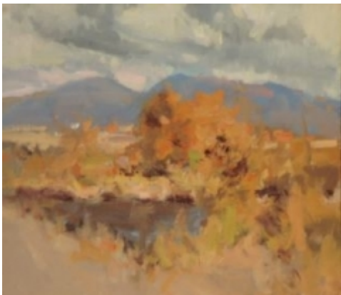
"Autumn Streamside" by Gene Costanza 7" x 8" $850

We also have a special NEW arrival of several miniature landscapes ranging in sizes of 6" x 8" to 10" x 12" by Master Landscape artist, Gene Costanza . If you would like to receive all images of Gene's new miniature collection, please e-mail cwagner@mgalleryofflineart.com with your request.