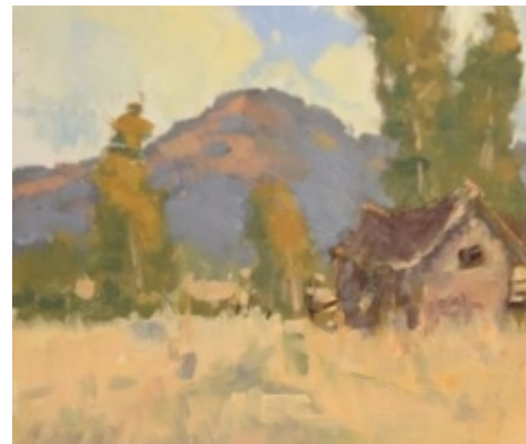
"Ramshackle" by Gene Costanza 8" x 9" $925