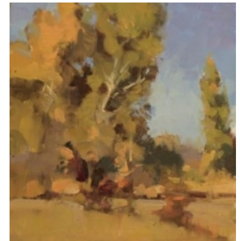
"Cottonwoods Waiting to Turn" by Gene Costanza 9" x 8" $925